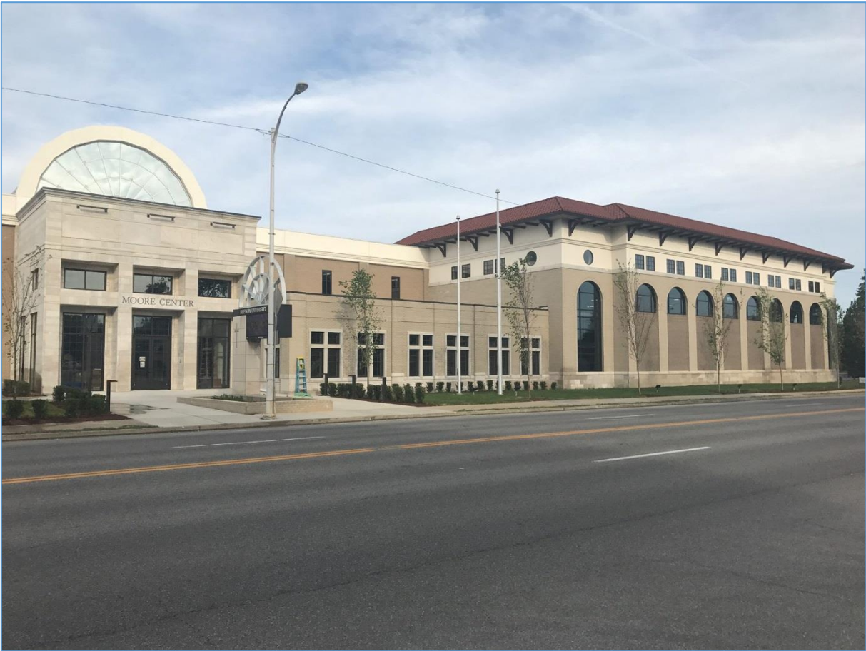
The Moore Center