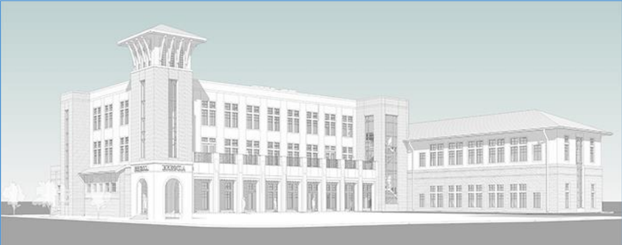
The C.E. Field Center for Professional Studies